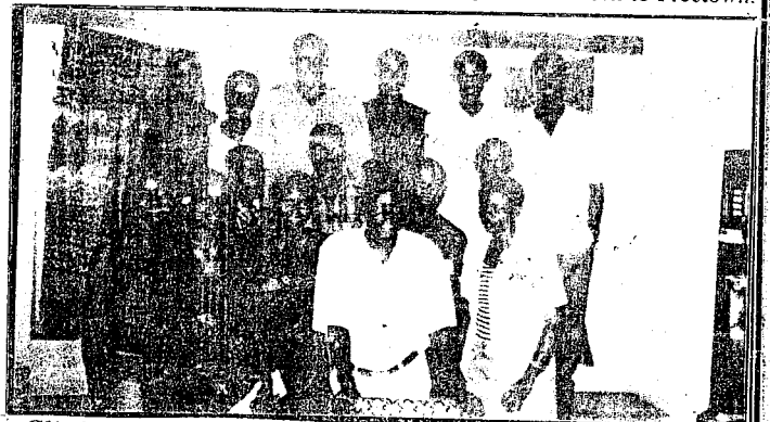
Clinic members: poised to help the clinic grow more