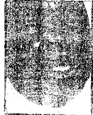
H.E. KAIBAH portion of land occupied by the Guinean Army

belongs to Sierra Leone and that only the river that forms the boundary between Sierra Leone and Liberia belongs to Guinea, they still insist that Yenga belongs to Guinea.