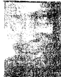
LANSANA CONTE reportedly added to the river and given to Guinea

for landing facilities after crossing the river into Sierra Leone. Now they have ignored all of that and they insist that Yenga and all the surrounding villages, plantations, which our people planted, diamonds and other natural resources