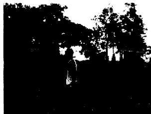
Sierra Leone rebels' future looks bleak