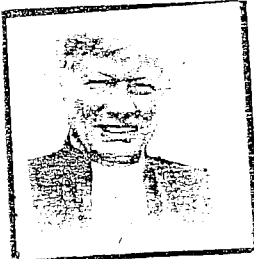
Judge Geoffrey Robertson

law. Justice Geoffrey Robertson has further assured that to re-