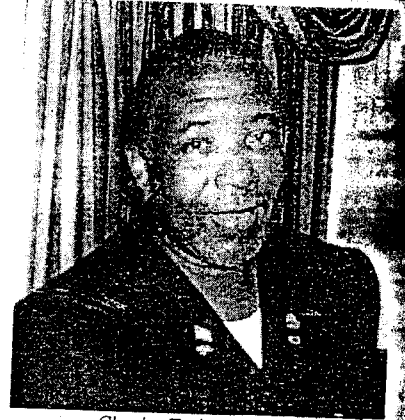
Charles Taylor, fugitive