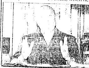
Charles Taylor, time running out

Taylor is indicted by the Special Court for bearing "the greatest responsibility" for crimes committed during Sierra Leone's civil conflict.