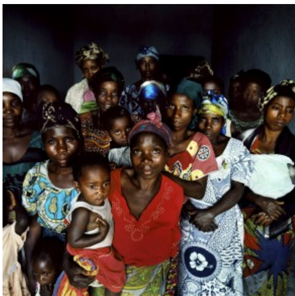
Survivors of sexual violence at a Caritas drop-in centre in the Democratic Republic of Congo.

Girls and women suffer disproportionately from this crime and this is not by accident; when you attack a mother, a wife, a sister or a daughter you are attacking the very fabric of society. By assaulting girls and women you wreak havoc on society, weaken the resistance of an opposing side, and ensure that communities will struggle to recover from the devastating repercussions of sexual violence long after the conflict has ended.