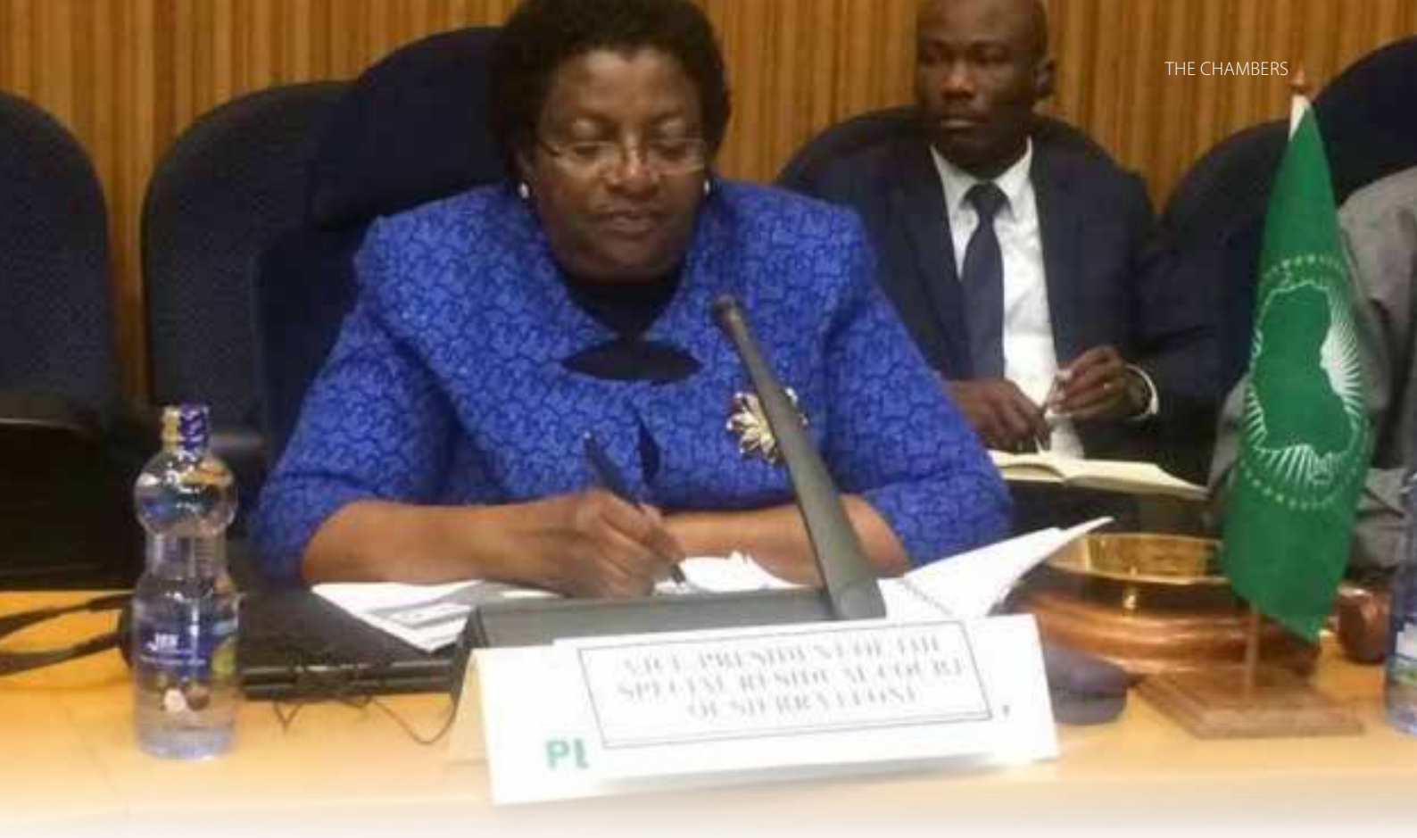
Justice Elizabeth Nahomya in Ethiopia.

conference were joined by Syrian judges, lawyers and representatives of non-governmental organisations. Among the many issues discussed were consistency and transparency of the administration of justice in the “courts” and dispute settlement bodies presently operating in parts of the country not controlled by the government. The status of displaced women and their children was also discussed, especially considering that the Syrian Constitution does not permit a child to acquire nationality through the mother, but only through the father, and many of these fathers are now missing. On 30 March 2017, Justice Doherty gave a talk on Special Court for Sierra Leone jurisprudential developments in the field of women’s and children’s rights to the International Law Association, Irish Branch.