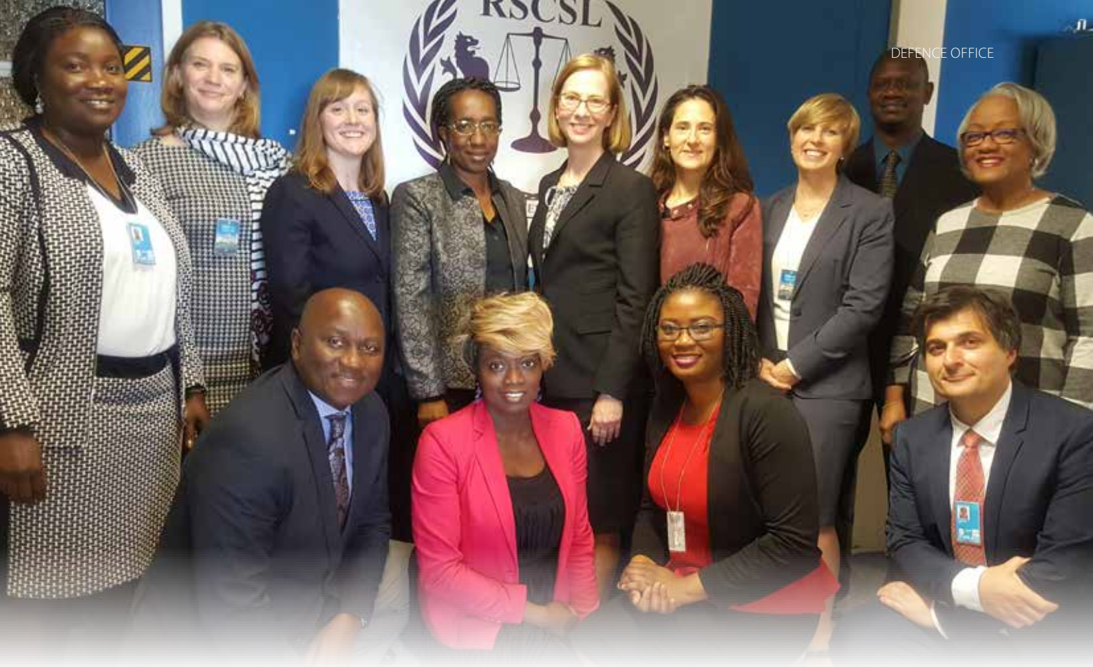
OC and Hague Staff.