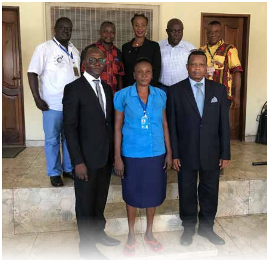
RSCSL Freetown Staff Members.

The Residual Special Court’s approved budget for 2017 was in