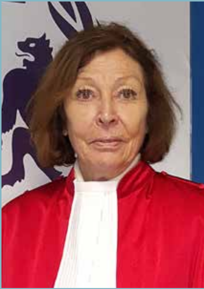
Justice Renate Winter