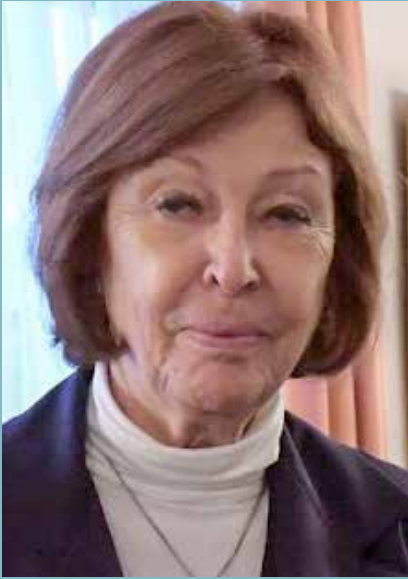
Justice Renate Winters