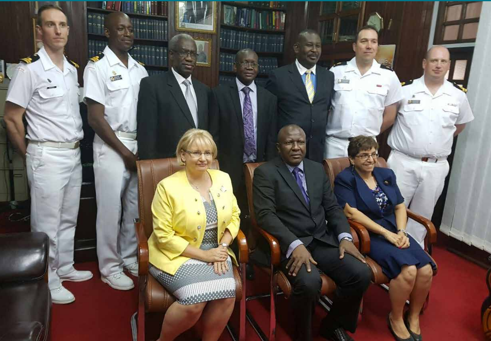
RSCSL officials meet with visiting Canadian UN delegation.