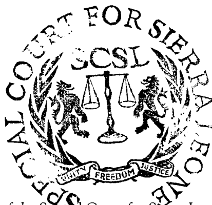
[Seal of the Special Court for Sierra Leone]