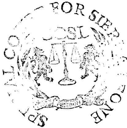
[Seal of the Special Court for Sierra Leone]