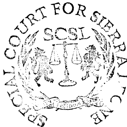
Seal of the Special Court for Sierra Leone

Judge Benjamin Mutanga Itoe The Trial Chamber