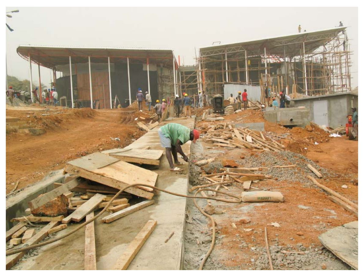
Flashback to 2004: Construction of the courthouse.