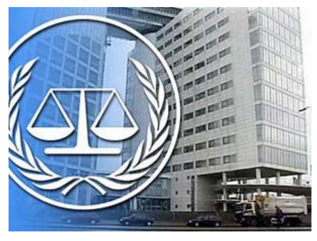
The ICC's Appeals Chamber rejected Kenya's efforts to have the Ocampo Six tried in the country for the second time

The International Criminal Court (ICC)'s Appeals Chamber Thursday unanimously rejected Kenya's latest effort to present new information on national investigations into the Ocampo Six.