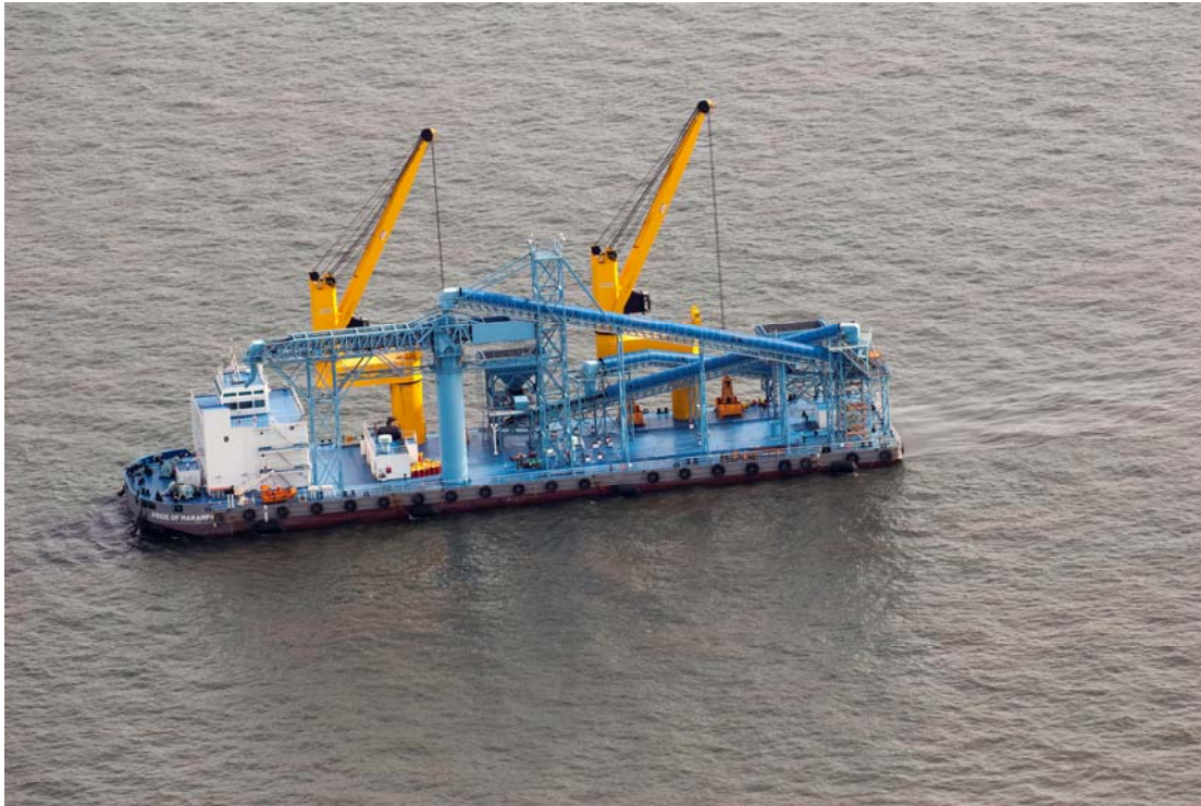
The Pride of Marampa