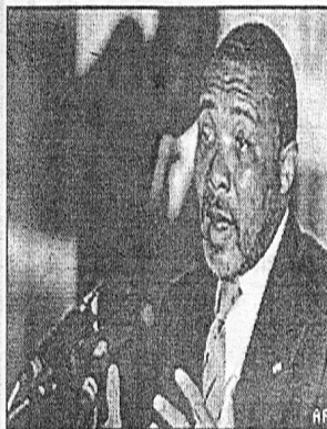
Charles Taylor denies all the charges against him