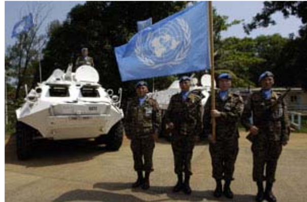
Mongolian contingent in Freetown, Sierra Leone