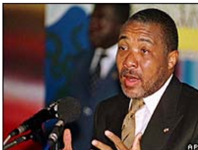
Charles Taylor denies all the charges against him