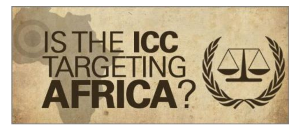
African Race Hunting, the Race Card and Racing After African Thugs?

Hailemariam Desalegn, the titular prime minister of Ethiopia, says the International Criminal Court (ICC) is on African safari. In May 2013, according to the BBC, Desalegn said, "African leaders were concerned that out of those indicted by the ICC, 99% are Africans. This shows something is flawed within the system of the ICC and we object to that. The process has degenerated into some kind of race hunting." Last week a spokesman for the ruling regime in Ethiopia chimed in. "We never appreciated what the ICC has been doing, particularly when it comes African leaders, and its belittling and it's disparaging the African leadership."