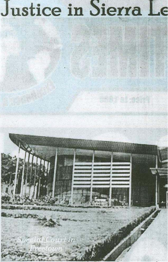
but my conversations with Sierra Leoneans also indicated a profound indifference towards the court.

Is this because the harm caused is simply beyond comprehension? Doubtful: this has never been a reason for popular attention to shy away. Or perhaps it is because trials like those at the special court are just too far away? Maybe so,