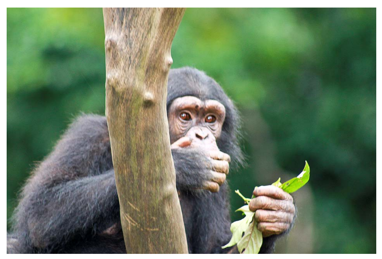
A chimp at the Tacaguma chimp reserve.