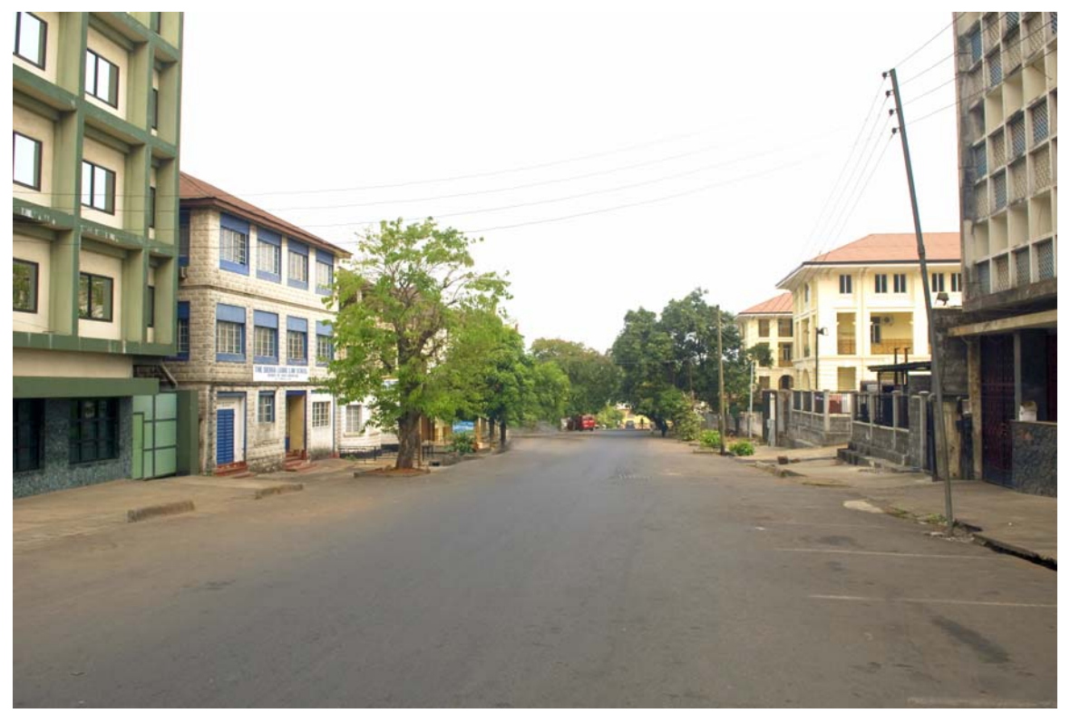
Lamina Sankoh Street, empty of traffic on a Sunday morning. Who was Lamina Sankoh? See today's 'Special Court Supplement'.