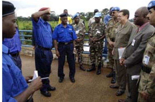
Minister Samukai, SRSR Doss and Maj. Gen. Tahir meet with Sierra Leonean authorities on Mano River Union Bridge, Grand Cape Mount County

Monrovia, Liberia – The Special Representative of the Secretary-General, Mr. Alan Doss, and the Minister of Defence, Mr. Brownie Samukai, together with UNMIL Deputy Force Commander, Maj.-Gen. Muhammad Tahir, and other UNMIL and government officials today met with Sierra Leonean authorities on the Mano River Union Bridge in Bo Water Side, Grand Cape Mount County, to discuss means to enhance the level of individual and joint security operations and patrols along the common border.