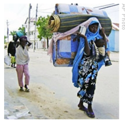
Women and children carrying their belongings flee Mogadishu fighting, May 24, 2009

As an international meeting on Somalia gets under way in Rome, U.N. agencies say that war crimes and crimes against humanity are being committed on a daily basis in the Somali capital, Mogadishu. For the past month, Islamist insurgents have been battling pro-government forces in the heaviest fighting the capital has seen in years.