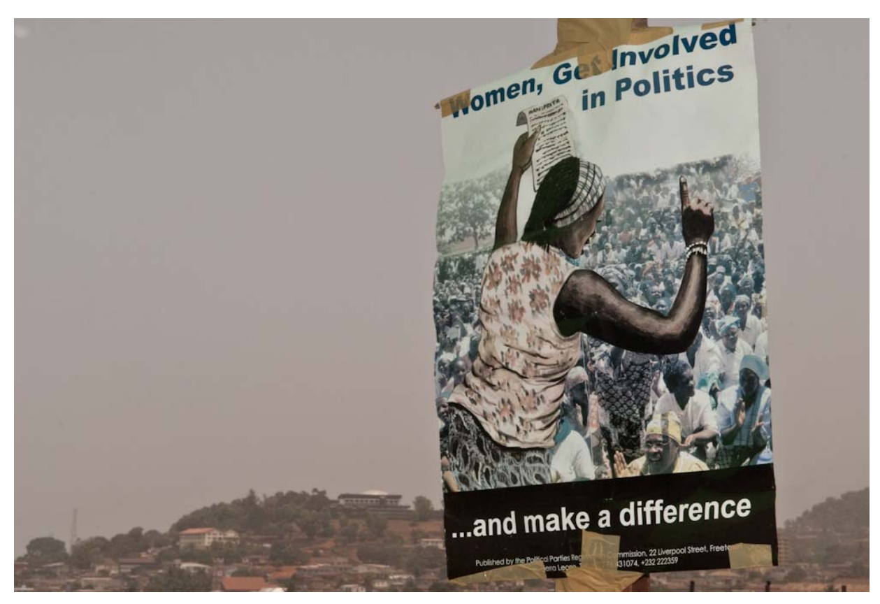
A poster for International Women's Day, with Parliament in the distance.