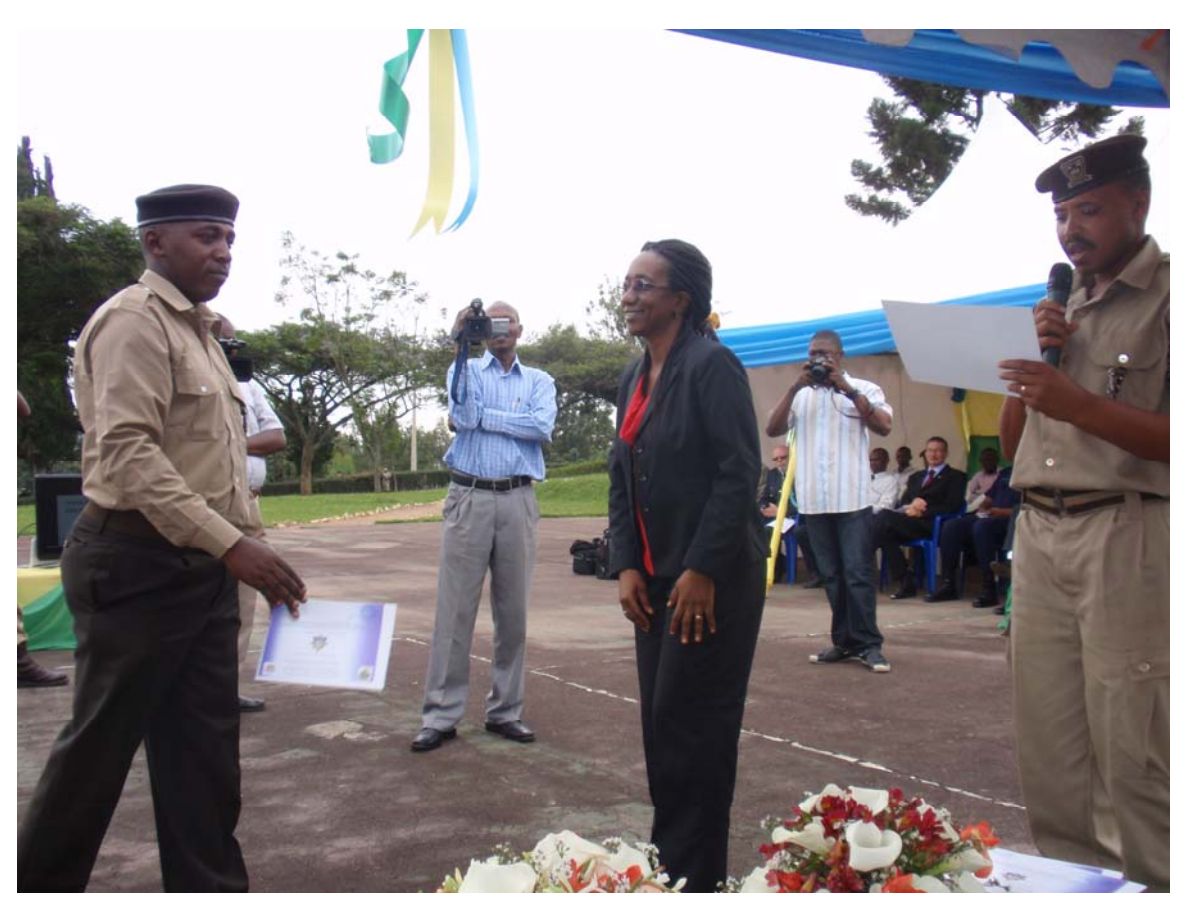
Registrar at award ceremony for prison officers in Rwanda