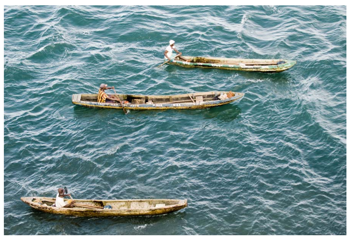
Small fishing boats briefly skirt the shoreline at Aberdeen before heading out to sea.