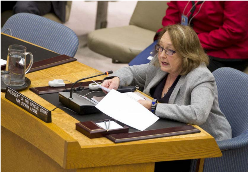
Justice Shireen Avis Fisher, President of the Special Court for Sierra Leone, addresses the Security Council.

9 October 2012 – The United Nations today praised the “historic” work done by the Special Court for Sierra Leone (SCSL) to prosecute sexual and gender-based crimes committed during conflicts, and called for increased support for the Court’s work from the international community.