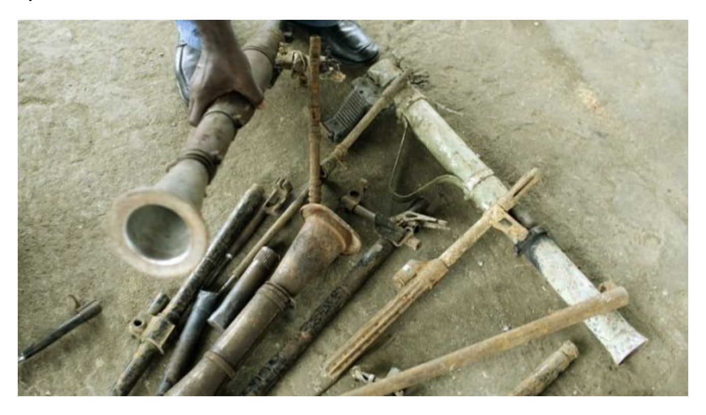
A Liberian holds an old bazooka as he works for a project to make tools out of weapons in Monrovia, October 7, 2007. Weapons which were once the cause of untold misery in a nation scarred by civil wars are now being transformed into symbols of hope for Liberians.

MONROVIA (AFP) – German blacksmith Manfred Zbrzezny and his apprentices hammer, file and weld in a steamy, dark workshop on the outskirts of the Liberian capital Monrovia, surrounded by parts for AK-47s, bazookas and other deadly arms.