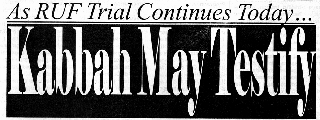
Exclusive Friday, 11 April 2008

As the marathon trial of former Revolutionary United Front (RUF) fighters continues today, 11th April, 2008 at the Special Court Trial