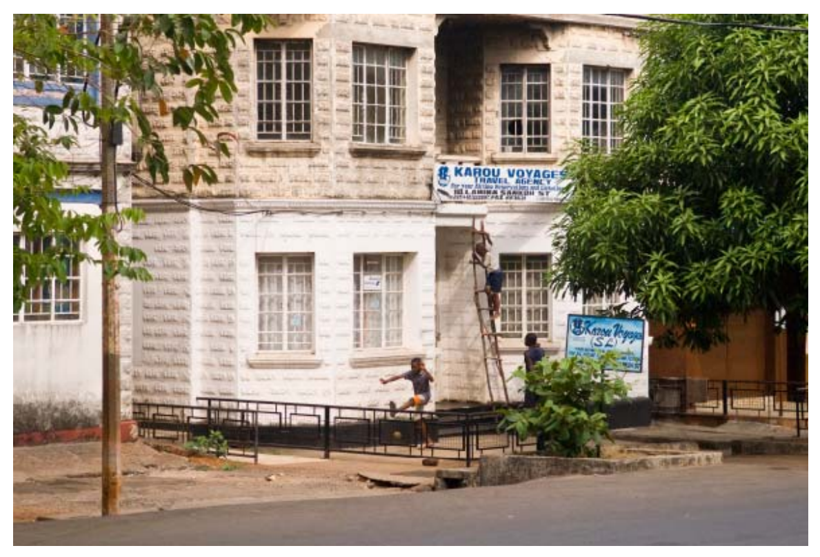
Boys 'borrow' a ladder to rescue their ball from the balcony of a building.