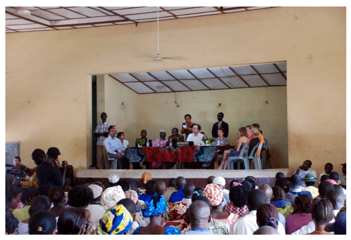
The Registrar at an outreach event in Makeni last week