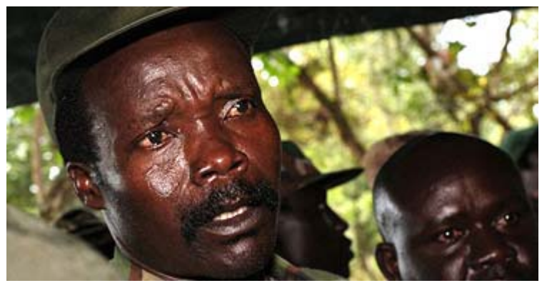
LRA rebel leader Joseph Kony has been charged with war crimes, but many Ugandans fear his arrest may cause more problems for the country than it would solve.

The newly established international criminal court risks being "fatally damaged" by demands that it cancel its first ever war crimes indictment because it is an obstacle to ending Uganda's 20-year civil war.