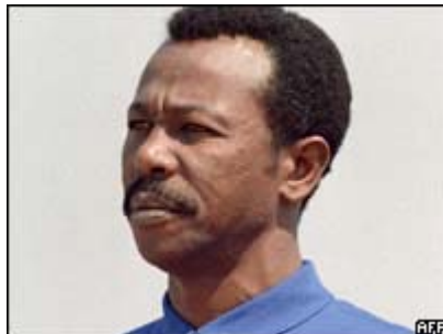
Mengistu Haile Mariam has lived in exile for 15 years

He has refused to recognise the legal basis of the trial, accusing those who overthrew him of being mercenaries and colonisers.