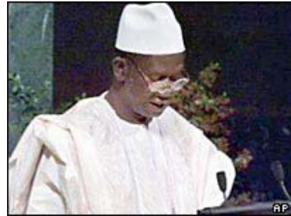
President Conte won a third term in 2003 elections despite poor health

The main trade unions want the government to agree to salary rises.