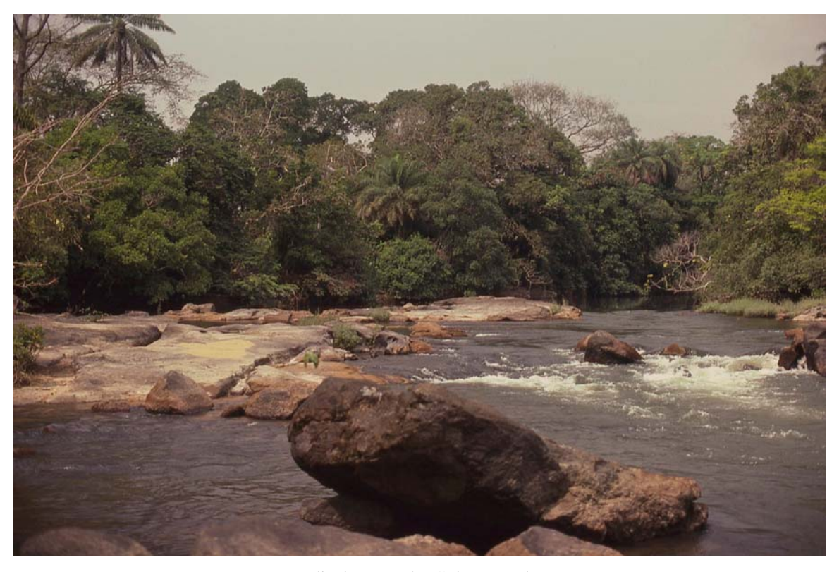
Meli River, on the Guinea Border.