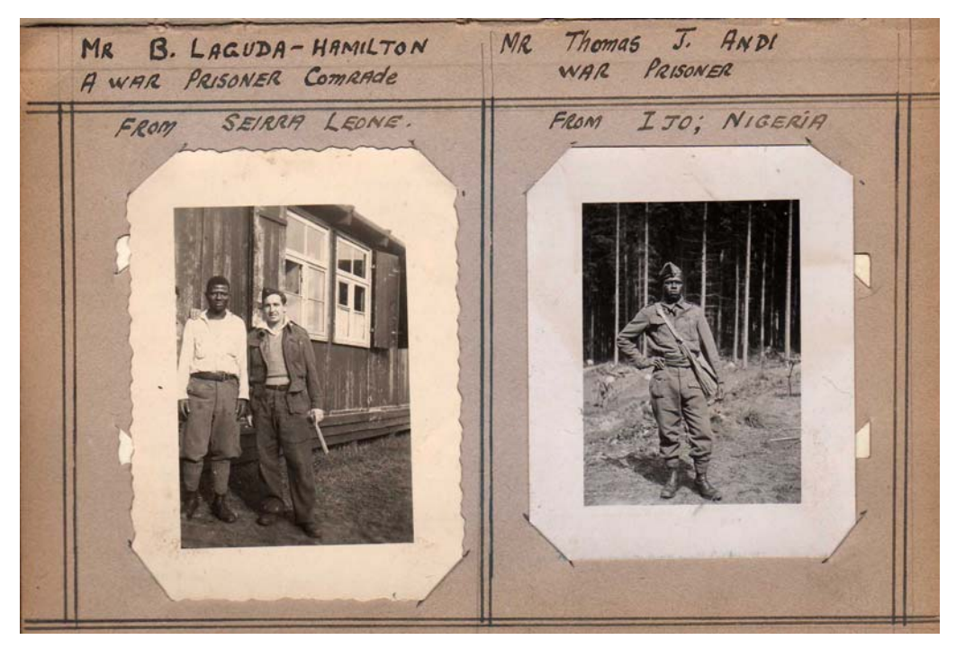
A photo from a diary kept by West African prisoners-of-war in a German prison camp during World War II.