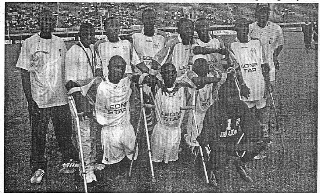
Victorious Salone Amputee Team One

In the second match, Leone Stars single leg amputee