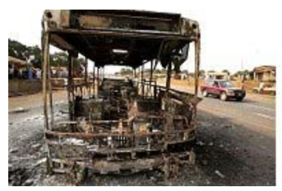
Burned bus on a street in Conakry

In Guinea's capital, people are stocking up on supplies in anticipation of a renewed strike, following violent protests that have left more than a dozen people dead. Union leaders and the opposition are calling for the president to go, saying his appointee as prime minister is too close an ally, and lacks the independence union leaders demanded. Phuong Tran reports from VOA's regional bureau in Dakar.