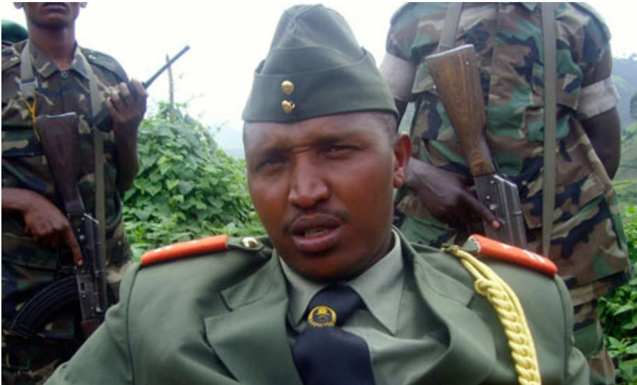
General Bosco Ntaganda, who was chief of military operations under Thomas Lubanga.

Rebel leader Thomas Lubanga may now be in jail, but Rwanda continues to support his co-accused, Bosco Ntaganda