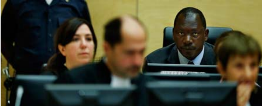
Mr Thomas Lubanga Dyilo in ICC Courtroom I for his sentencing hearing on 10 July 2012

Today, Trial Chamber I of the International Criminal Court (ICC) sentenced Thomas Lubanga Dyilo to a total period of 14 years of imprisonment. The Chamber, composed of Judge Adrian Fulford, Judge Elizabeth Odio Benito and Judge René Blattmann, also ordered that the time from Mr Lubanga's surrender to the ICC on 16 March 2006 until today should be deducted from this sentence. Mr Lubanga Dyilo was found guilty, on 14 March 2012, of conscripting and enlisting children under the age of 15 and using them to participate in hostilities in the Ituri region in the Democratic Republic of the Congo, from 1 September 2002 to 13 August 2003.