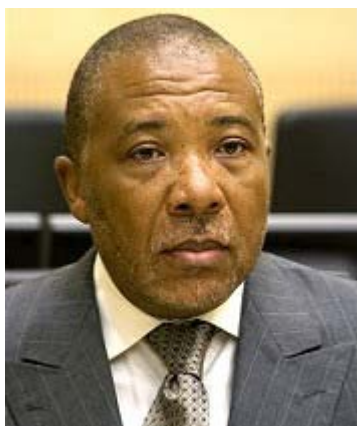
Charles Taylor (2006 file photo)