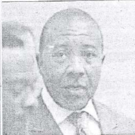
Former President Charles Taylor

The action of the Ugandan president, Judge at the Special Court on Monday during the beginning of the landmark trial of the former president, Charles Taylor, clearly portrays that Taylor will not get a fair trial as anticipated by many.