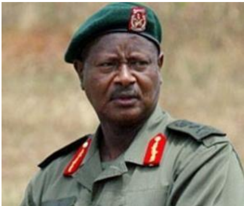
Ugandan President Yoweri Museveni has ruled Uganda since 1986.

The UN report suggests a mode of transitional justice in Congolese courts, but much of the international community has reacted skeptically, because the Congolese judicial system is barely functioning. A coalition of Africa advocates, including Friends of the Congo, Africa Faith and Justice Network, and many others, also say that justice is not possible in Congo because Rwanda and Uganda are occupying eastern Congo, and plundering its natural resource wealth, with Congolese President Joseph Kabila's collaboration. They will focus instead on pressuring President Barack Obama to end the U.S.A.'s longstanding military and diplomatic support for Rwandan President Paul Kagame, whose army is most controversially implicated in the report, in war crimes, crimes against humanity, and genocide against Rwandan Hutu refugees and Congolese Hutus in Congo.