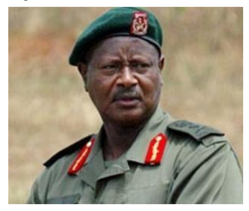
Ugandan President Yoweri Museveni has ruled Uganda since 1986.

The UN report suggests a mode of transitional justice in Congolese courts, but much of the international community has reacted skeptically, because the Congolese judicial system is barely functioning. A coalition of Africa advocates, including Friends of the Congo, Africa Faith and Justice Network, and many others, also say that justice is not possible in Congo because Rwanda and Uganda are occupying eastern Congo, and plundering its natural resource wealth, with Congolese President Joseph Kabila's collaboration. They will focus instead on pressuring President Barack Obama to end the U.S.A.'s longstanding military and diplomatic support for Rwandan President Paul Kagame, whose army is most controversially implicated in the report, in war crimes, crimes against humanity, and genocide against Rwandan Hutu refugees and Congolese Hutus in Congo.