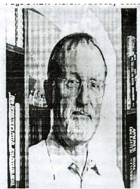
By Ian Smillie, Ottawa, Canada This book is about how diamonds fuelled some of the most brutal wars in Africa.

More than three million people died as a result of these wars in the 1990s and the early 2000s; many more millions of lives have been damaged, and the existence of entire nations has been called into question. The book is also about a campaign that began in 1998 to stop these 'conflict' or 'blood diamonds'. It is a campaign in which I have been deeply involved, but in this book I have mostly kept myself out of the story because it is one that involves hundreds of individuals, organizations and governments, each contributing in their own way.