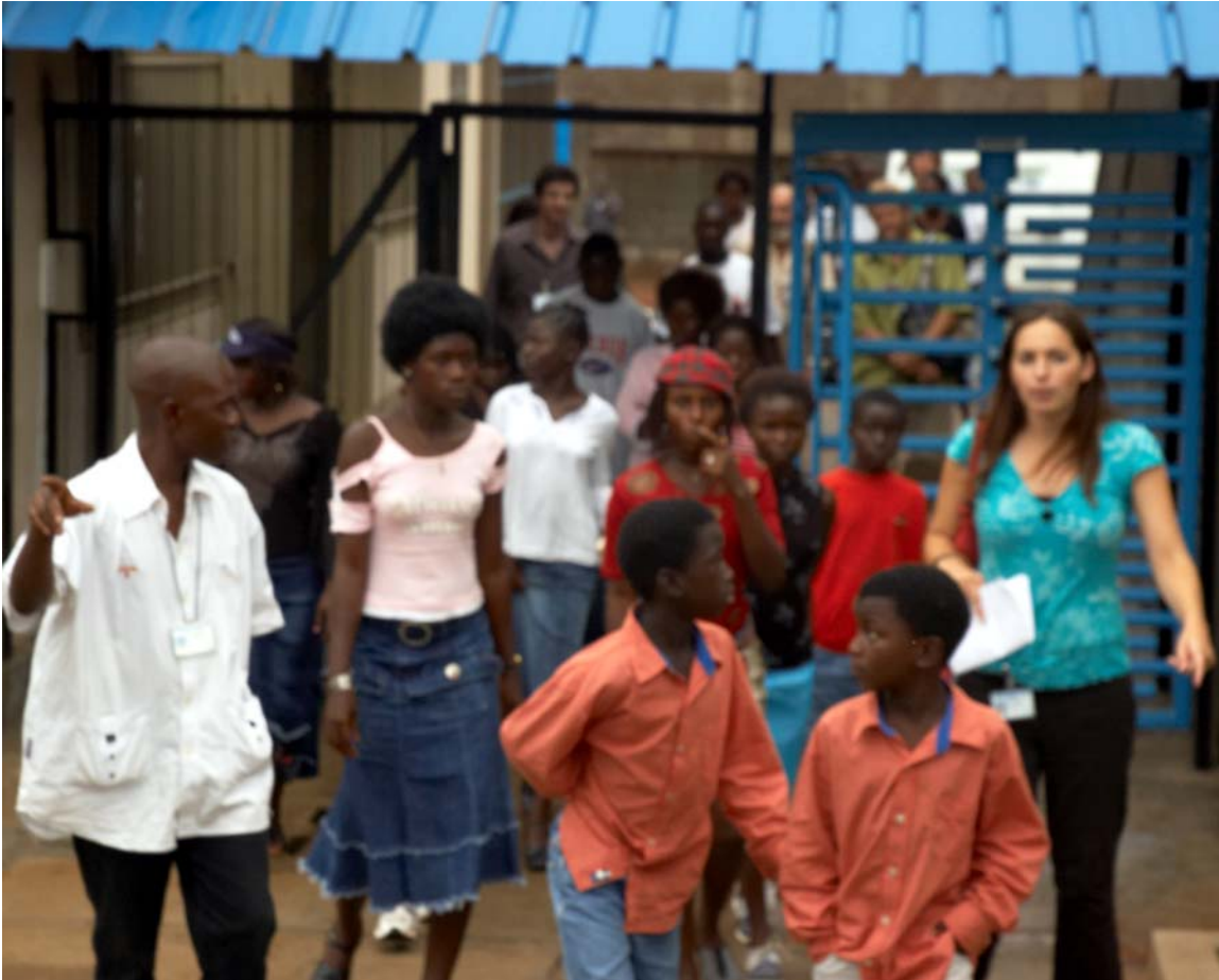
Children from International D.O.V.E. orphanage at Regent visited the Special Court on Wednesday.