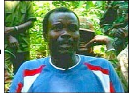
Uganda rebel leader Joseph Kony calls himself a freedom fighter

"It is the view of the office of the prosecutor and the government of Uganda that justice and peace have worked together thus far and can continue to work together," he continued.