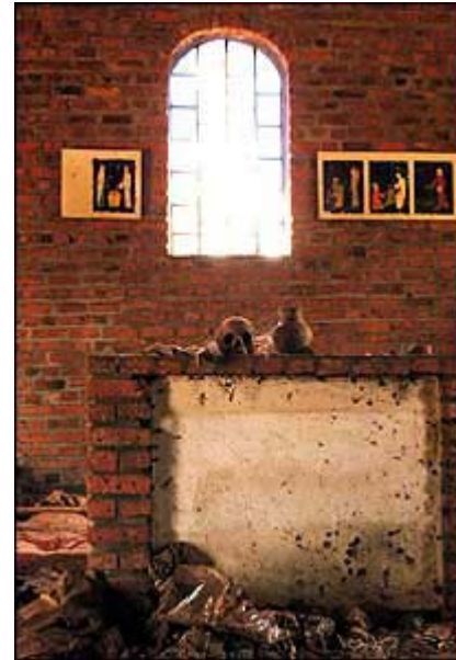
Many Rwandan Catholics believe the Church let them down in 1994

Some 800,000 Tutsis and moderate Hutus were slaughtered in the 1994 killings.