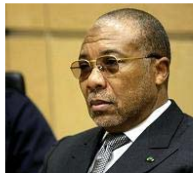
Charles Taylor in the courtroom, 07 Jan 2008