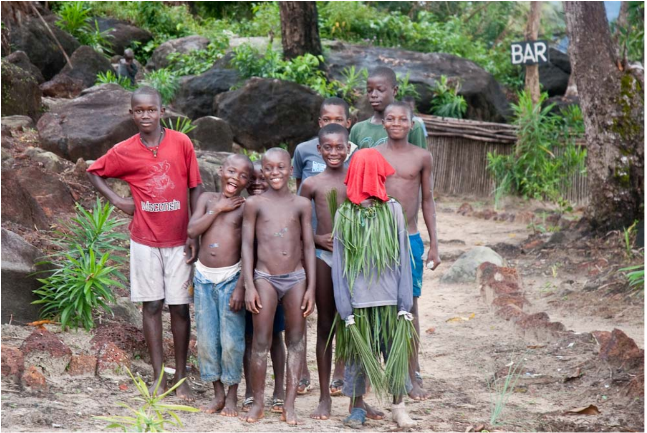
Masquerading boys at Baw-Baw beach.