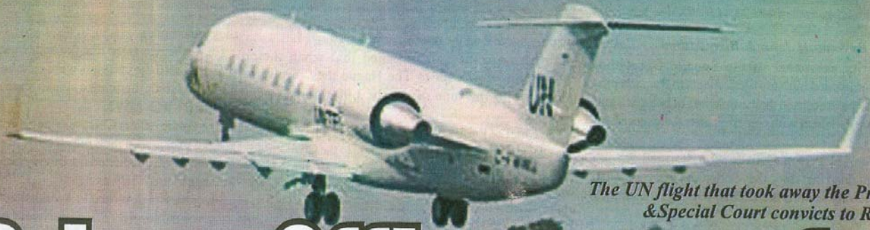
The UN flight that took away the Prison Officers & Special Court convicts to Rwanda