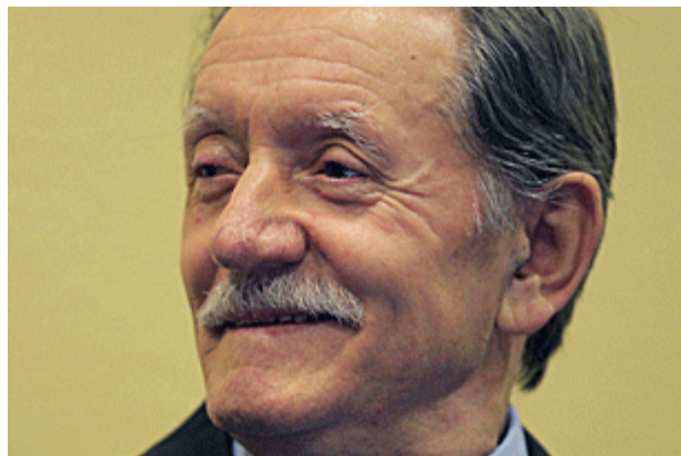
Dragomir Milosevic was a commander during the siege of Sarajevo, the Bosnian capital

Milosevic will serve his sentence, which includes time spent at the detention centre in The Hague since his surrender in late 2004, in a yet to be determined country.