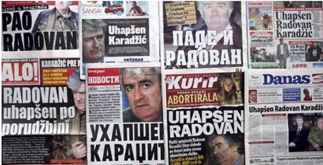
The Hague, Netherlands

Radovan Karadzic conducts his own defence in his genocide trial, but he has an international team of top lawyers, academics and interns at his disposal. For months they have been preparing the defence of the former Bosnian-Serb leader.