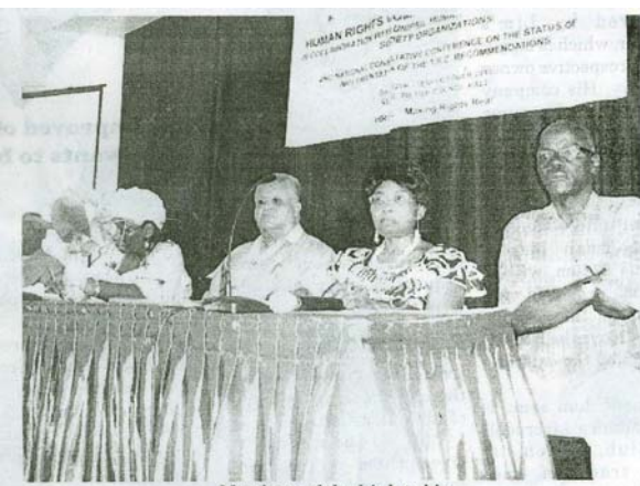
Members of the high table

She said out of the 30,000 war victims that have been regis-