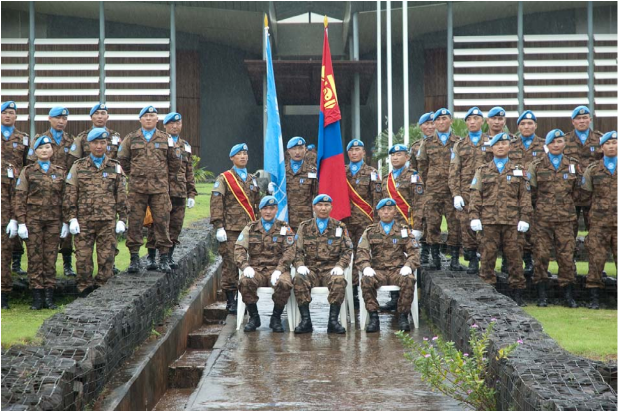
Rotation ceremony, as MONBATT VII of the Mongolian Guard Force handed over to MONBATT VIII. See more photos in today's 'Special Court Supplement' .