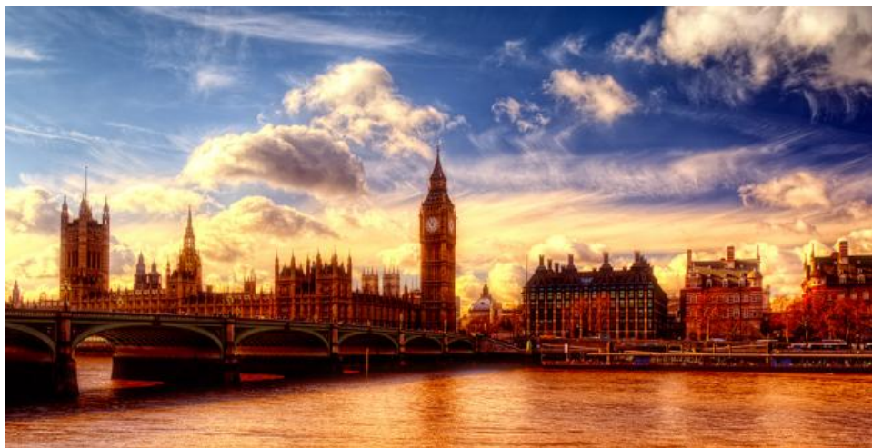
London, United Kingdom

Inconsistencies in the way Britain applies international law are allowing war criminals to visit the country with impunity, a parliamentary committee said on Tuesday.