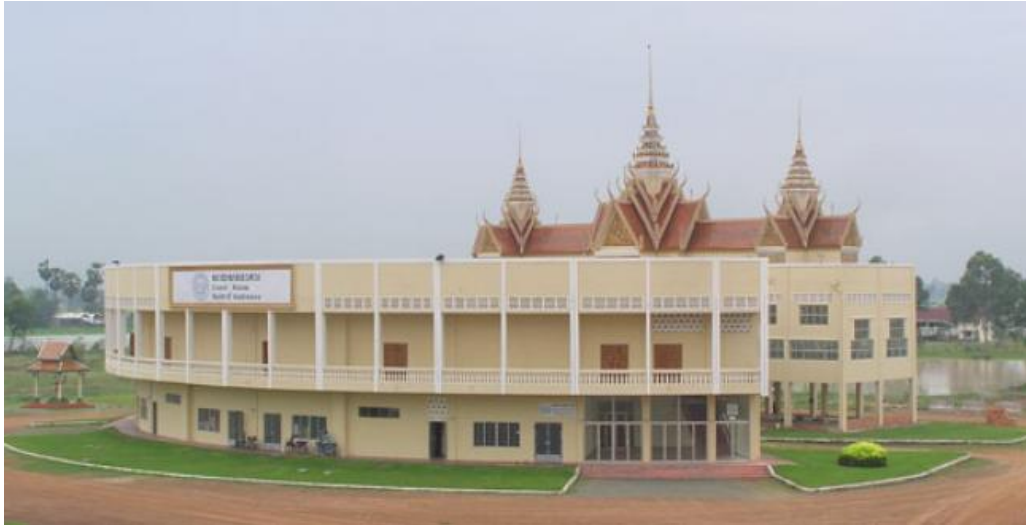
Phnom Penh, Cambodia

The United Nations and Cambodia have agreed to tackle corruption at a court set up to try former Khmer Rouge leaders, according to a joint statement released here Wednesday.