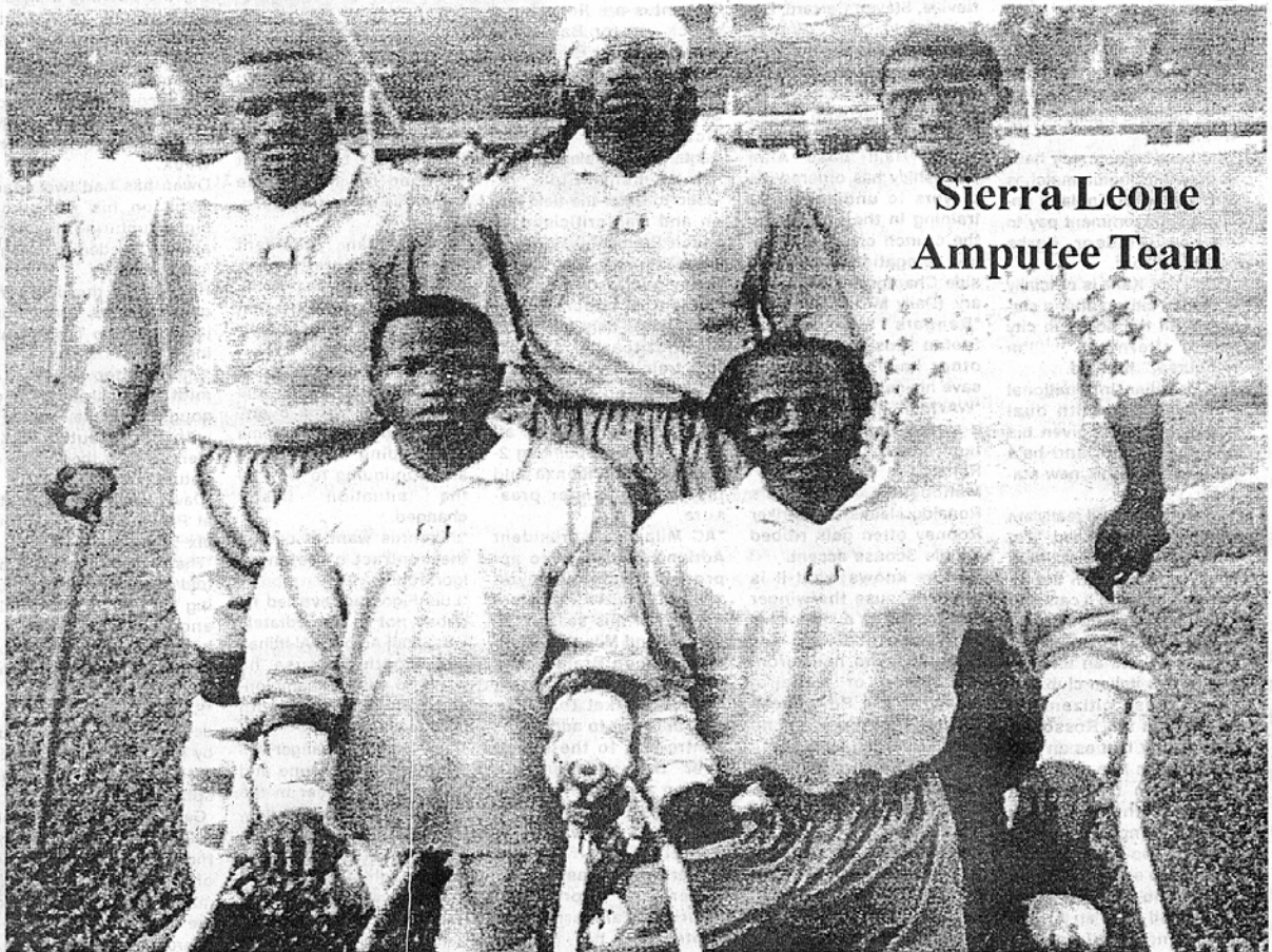
Sierra Leone Amputee Team

I but we've put that nightmare behind our backs as we have bounced back for good, not even Sierra