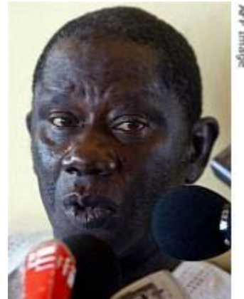
Guinea President Lansana Conte (file photo)

Sierra Leonean President Ahmad Tejan Kabbah says he and other regional leaders are in contact with Mr. Conte and hope to find a peaceful end to Guinea's political turmoil.