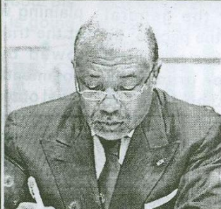
Former Liberian President Charles Taylor at the U.N.-backed Special Court for Sierra Leone in The Hague