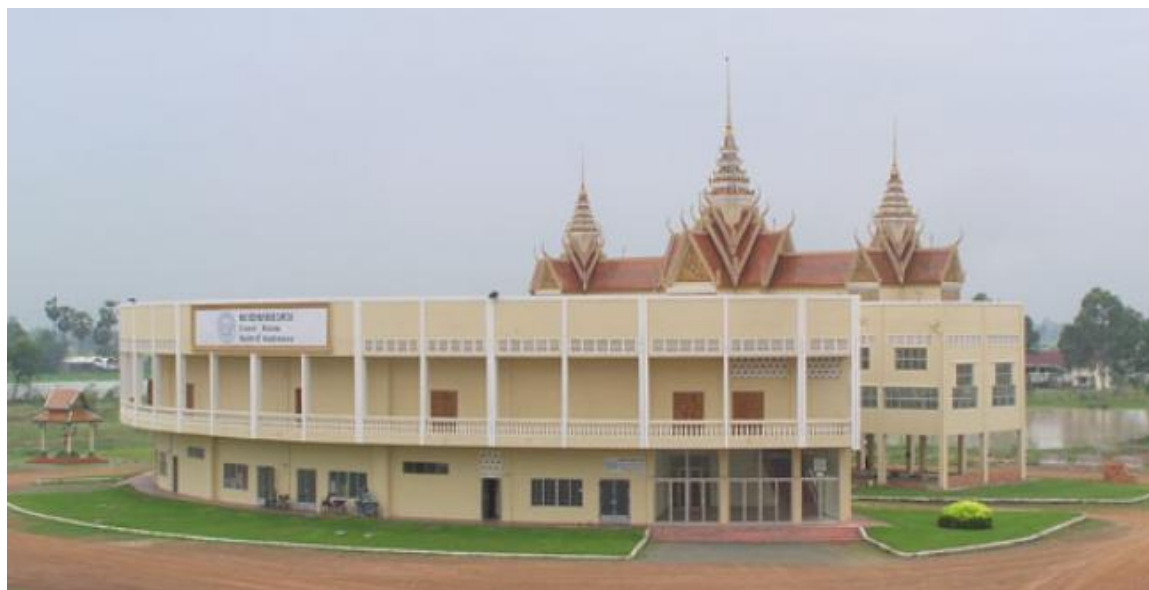
Phnom Penh, Cambodia Phnom Penh

The co-investigating judges of Cambodia's genocide tribunal have