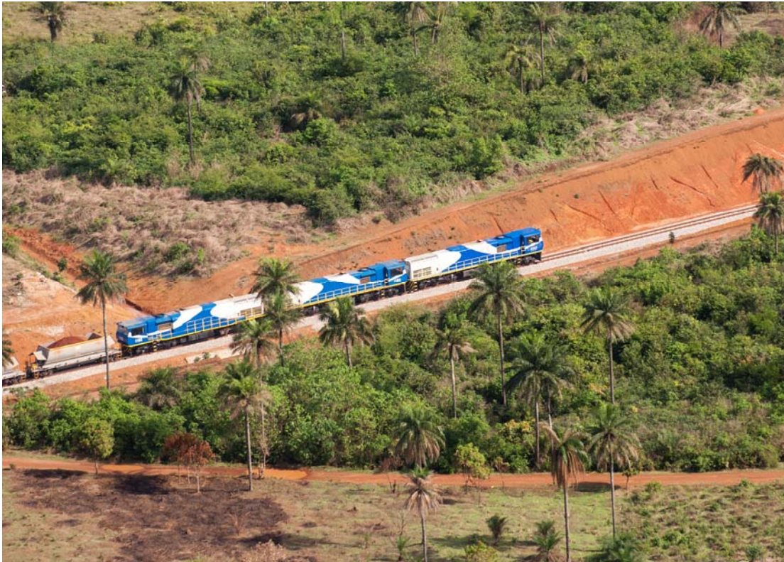
A train ferrying iron ore snakes through Bumbuna