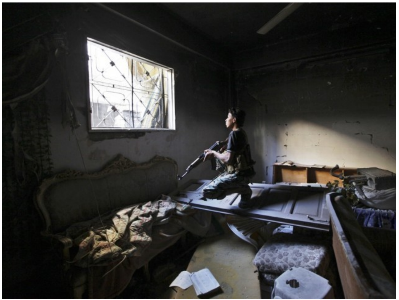
A Free Syrian army fighter carries his weapon in a damaged building in Jubaila neighbourhood in Deir al zor, eastern Syria October 13, 2013.

WASHINGTON: When the guns fall silent in Syria and the killing eventually stops, a key part of helping a traumatised people rebuild and heal will be bringing to justice those behind years of shocking brutality.