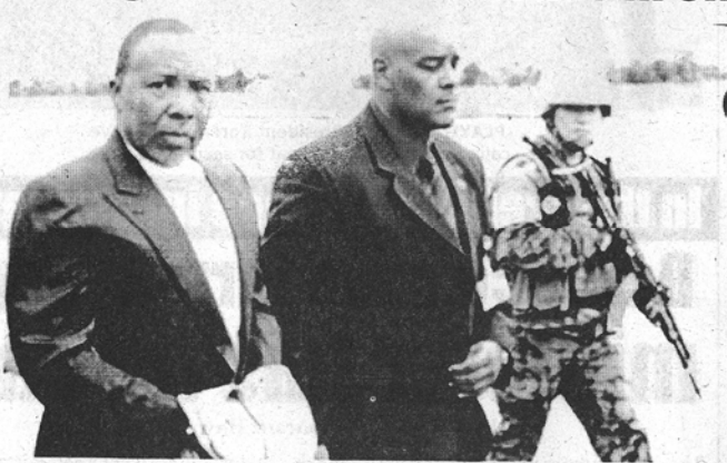
Charles Taylor being transferred for trial in The Hague

Taylor's use of diamonds and timber to fund the conflicts in Sierra Leone and Liberia, left both countries with a major reform programmes, but In April 2012 the Special Court for continue to face difficulties in breaking Sierra Leone found former warlord with the corruption and abuse of the Taylor responsible for aiding and past. Liberia, for example, is reeling abetting crimes including pillage, from the government's illegal sell-off of murder and rape during Sierra a quarter of the country for logging