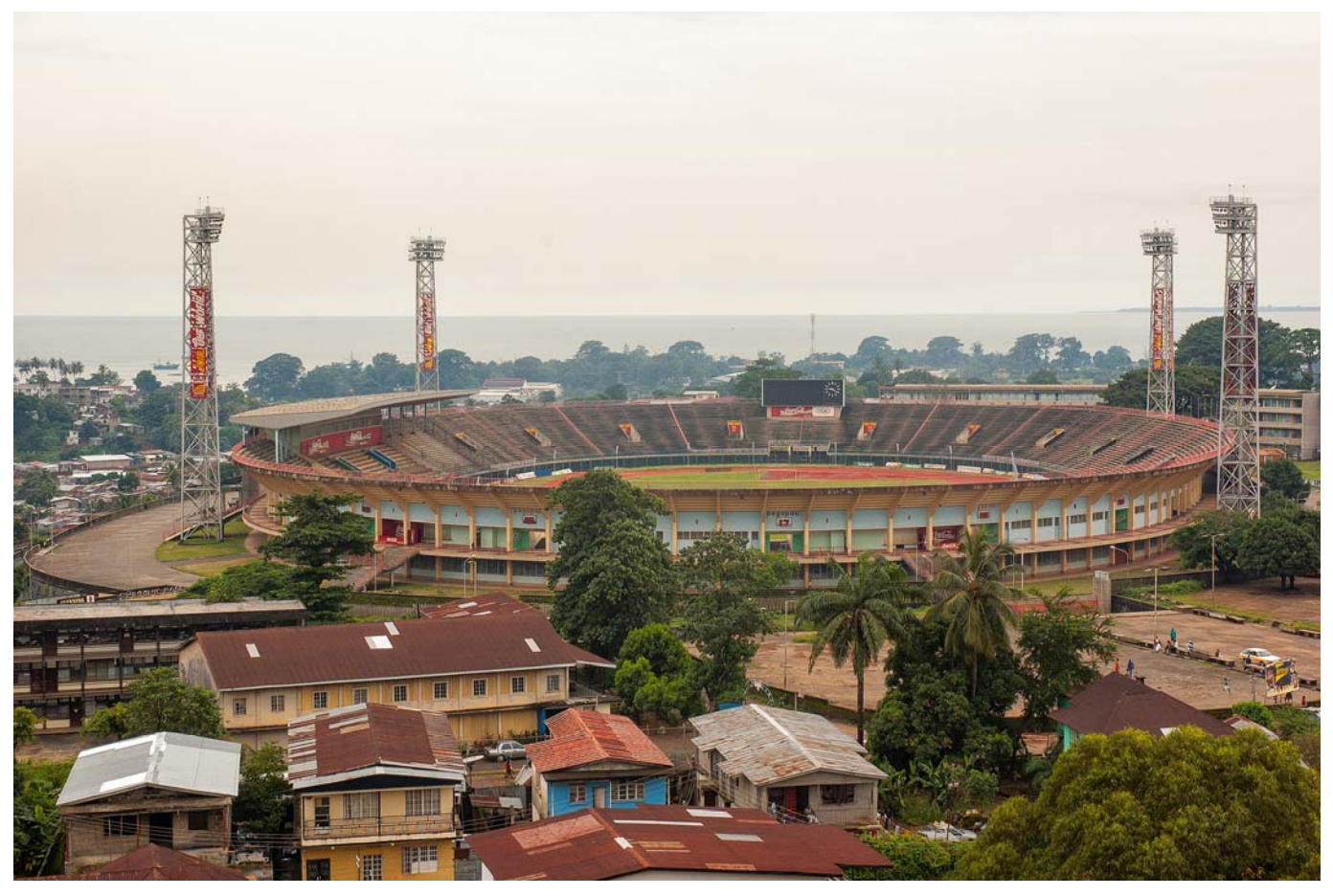
National Stadium, Brookfields, Freetown