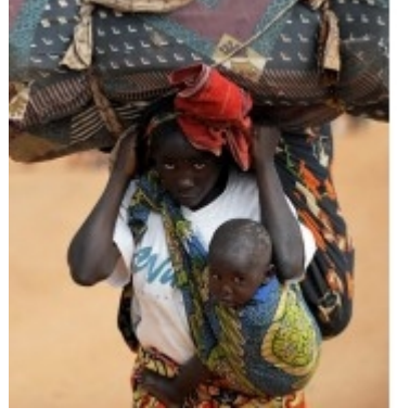
A woman carries some of her belongings on the main road crossing the North Kivu town of Kayna, Democratic Republic of Congo, 19 Nov 2008

The United Nation's Human Rights chief, Navi Pillay, condemns human rights abuses in the eastern Democratic Republic of Congo and says government forces and rebel groups are possibly guilty of war crimes and crimes against humanity.