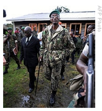
Rebel General Laurent

One of the reports focuses on the actions of government forces, some of whom engaged in large-scale pillaging, arbitrary killings and sexual violence. The report says these abuses were targeted against the very people they were supposed to be protecting in eastern Congo's provincial capital of Goma, and in surrounding towns and villages.