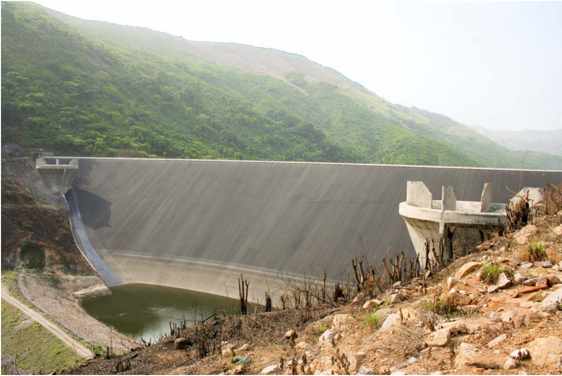
The dam at the Bumbuna Hydroelectric Project