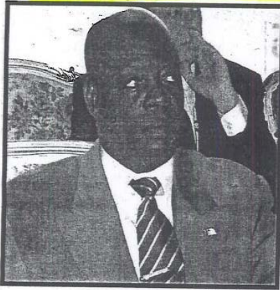
Former Pres. Moses Blah