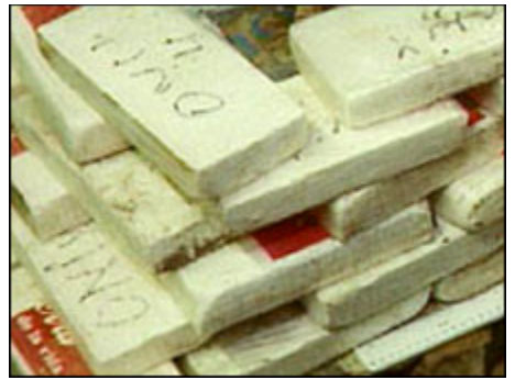
The UN has warned that West Africa is the new route for cocaine

The 700kg cargo, worth an estimated $60m, was abandoned on the runway shortly after arriving in the dark in the early hours of Sunday morning.