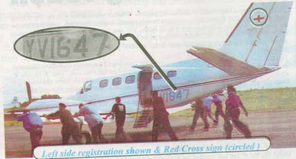
Left side registration shown & Red Cross sign (circled)

around 725kilos with an estimated street value of around $60 million.