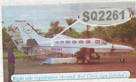
Right side registration shown & Red Cross sign (circled)

A further 7 foreign nationals Mexicans and Colombians were also arrested in Port Loko.