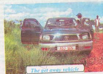
The get away vehicle