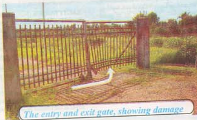
The entry and exit gate, showing damage

At the airport on Sunday afternoon Transport and Aviation Minister Kemoh Sesay said that he "flew over here under emergency circumstances that an irregular aircraft with irregular commodities in the aircraft" adding that as Minister his business is to make sure