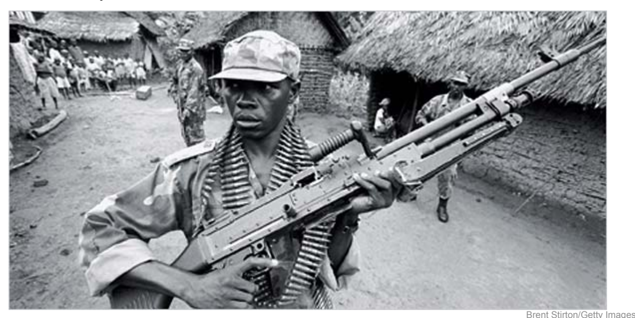
Sierra Leone, 2003: Patrolling the border with Liberia, trying to ward off rebel attacks.

The commonplace assumption that a more homogeneous society is a more peaceful society certainly sounds reasonable. Surely monoethnic Japan should have an easier time maintaining domestic order than Indonesia; or Slovenia than Macedonia. After all, in a country with numerous ethnic or religious groups, politicians are easily tempted to organize factions along group lines — which can lead to rising tensions and even civil war or the collapse of the state. In 1938, Benito Mussolini warned, "If Czechoslovakia finds herself today in what might be called a 'delicate situation,' it is because she was not just Czechoslovakia, but Czech-Germano-Polono-Magyaro-Rutheno-Rumano-Slovakia."