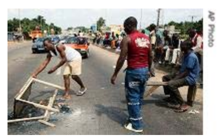
Supporters of Ivory Coast President Laurent Gbagbo block a road as part of a protest Wednesday, July 19, 2006

In Korhogo, a town of about 150,000, many people stay in the noisy restaurants until late into the night.