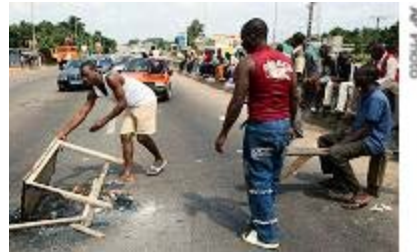
Supporters of Ivory Coast President Laurent Gbagbo block a road as part of a protest Wednesday, July 19, 2006

Carrying old muskets and wearing dreaded wigs and camouflage clothing, the Dozos do not want to be very visible.